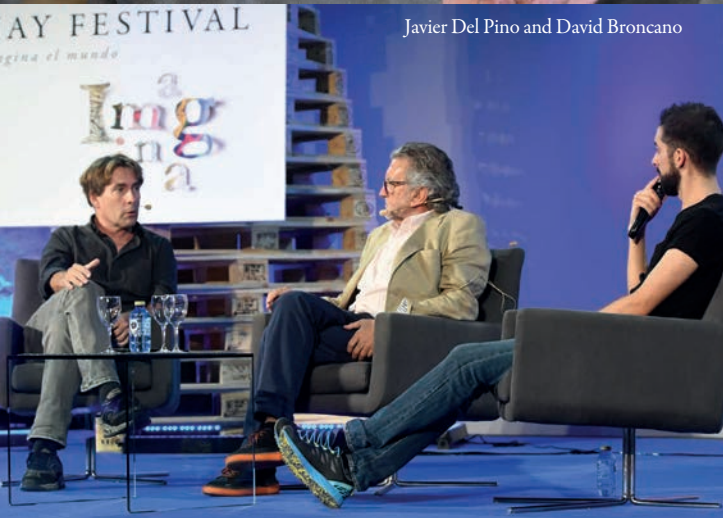
Javier Del Pino and David Broncano