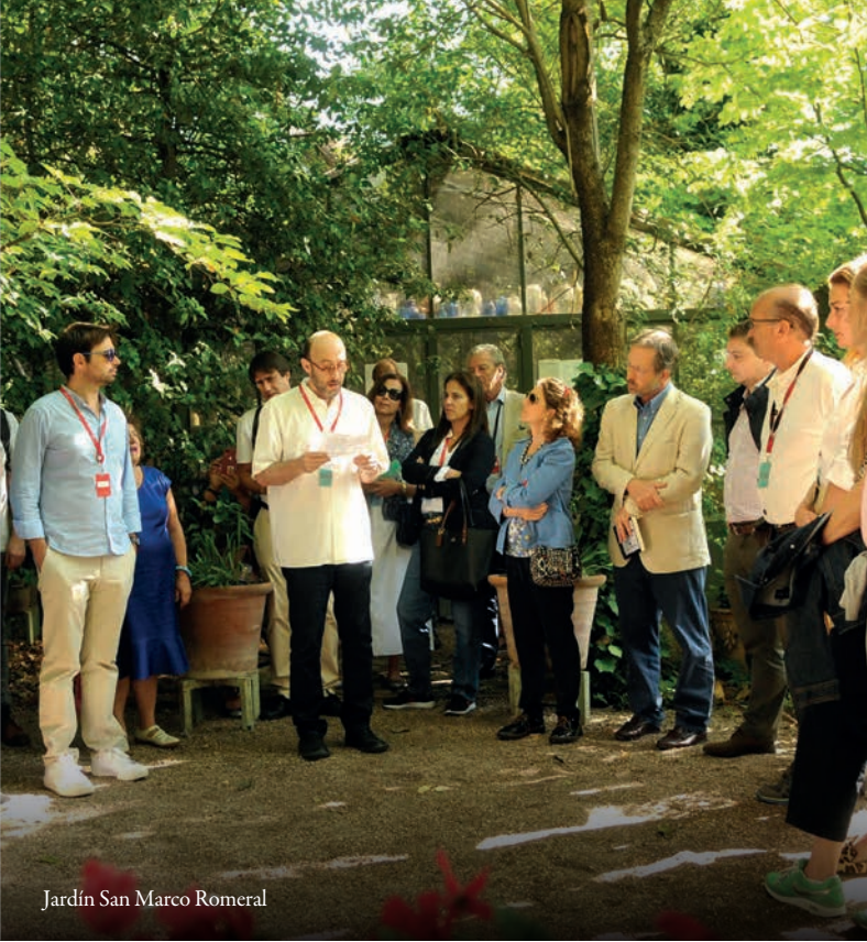
Jardin San Marco Romeral