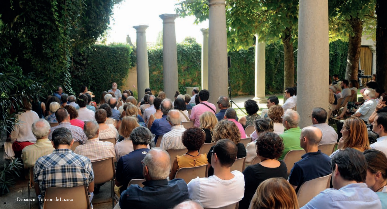
Debates in Torreón de Lozoya