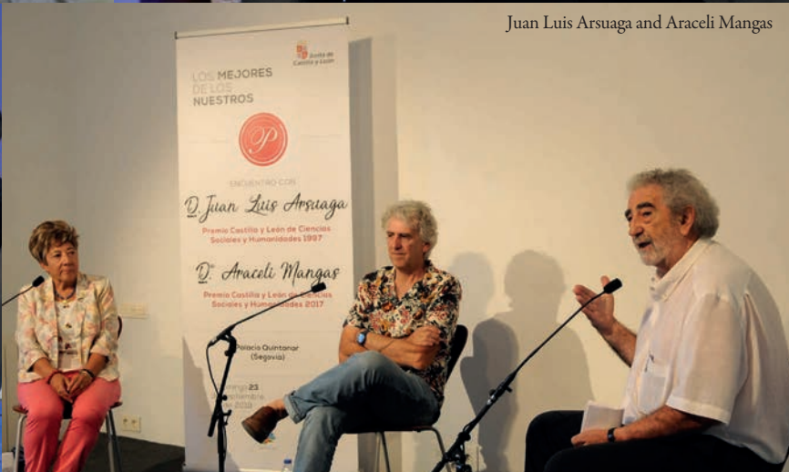
Juan Luis Arsuaga and Araceli Mangas