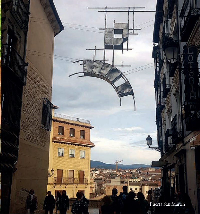
Puerta San Martín