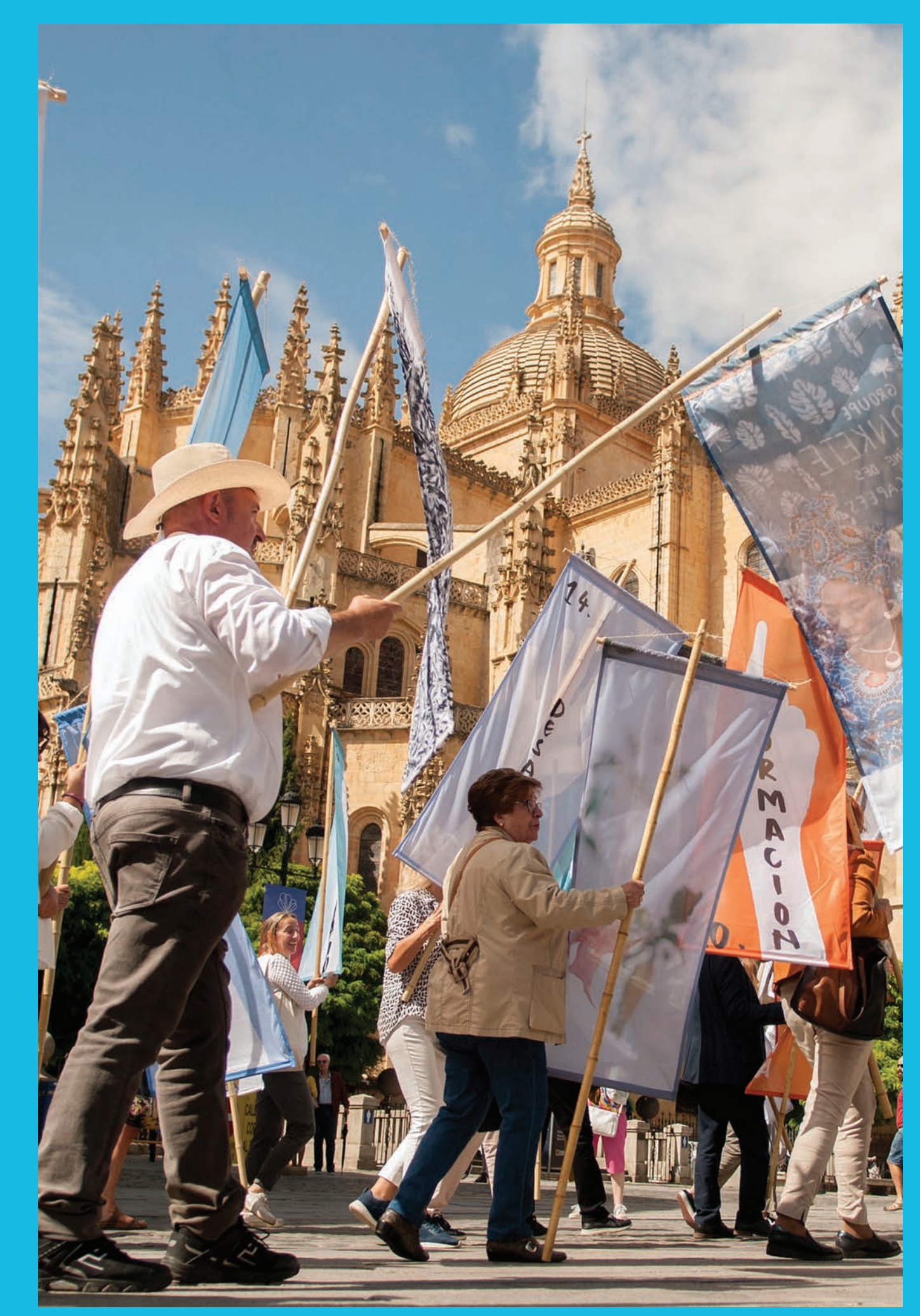
EstandARTES Humanos: Segovia for Human Rights event: AIDA Association