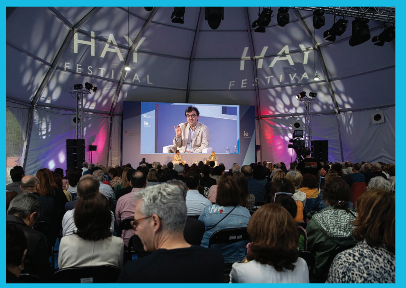
Javier Cercas in conversation with Vicente Vallés