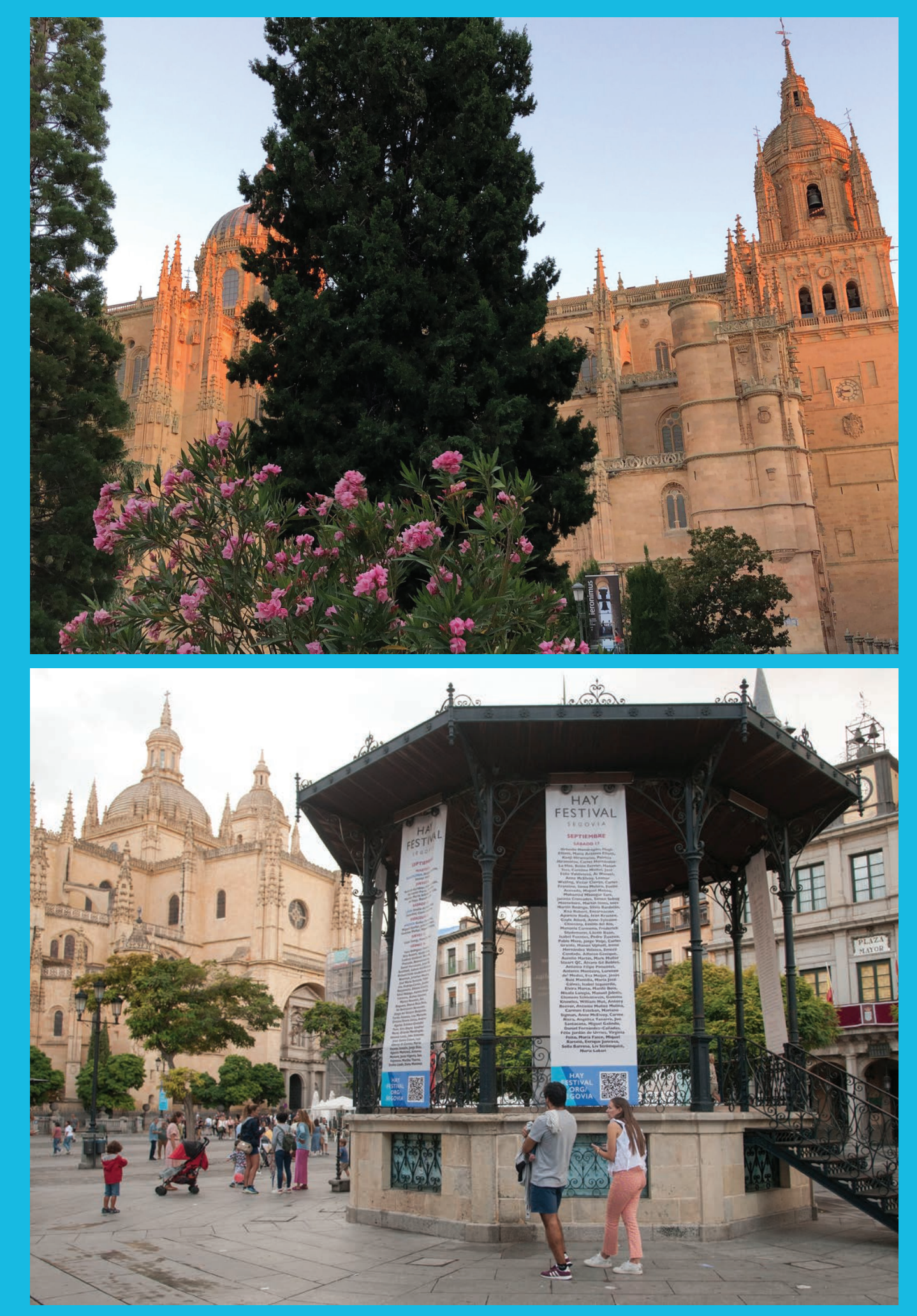
(Above) Segovia Cathedral; (below) Plaza Mayor, Se