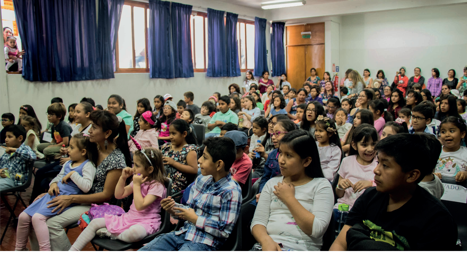
Hay Festivalito ran six free events for children and families