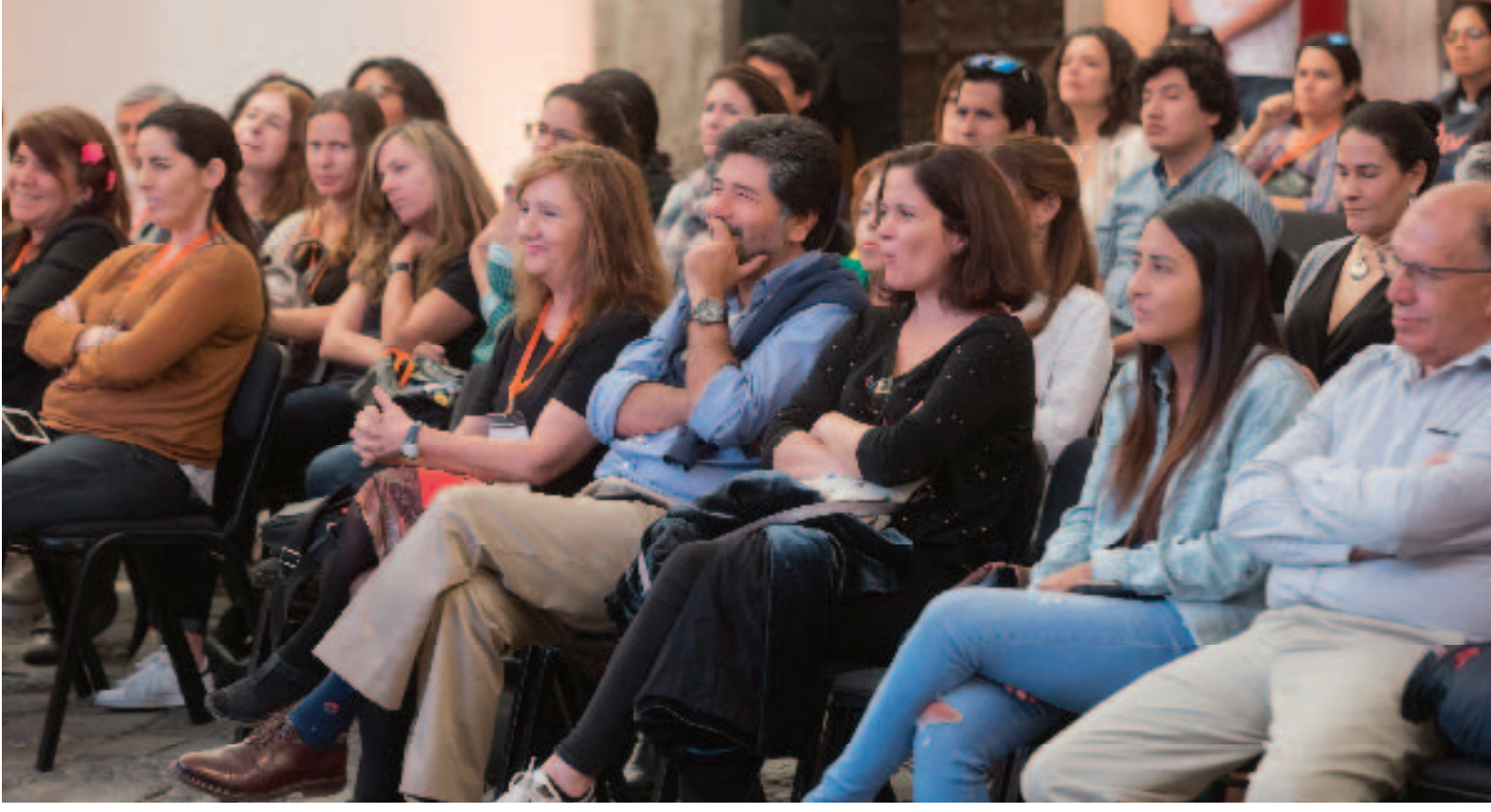
Audience in Arequipa