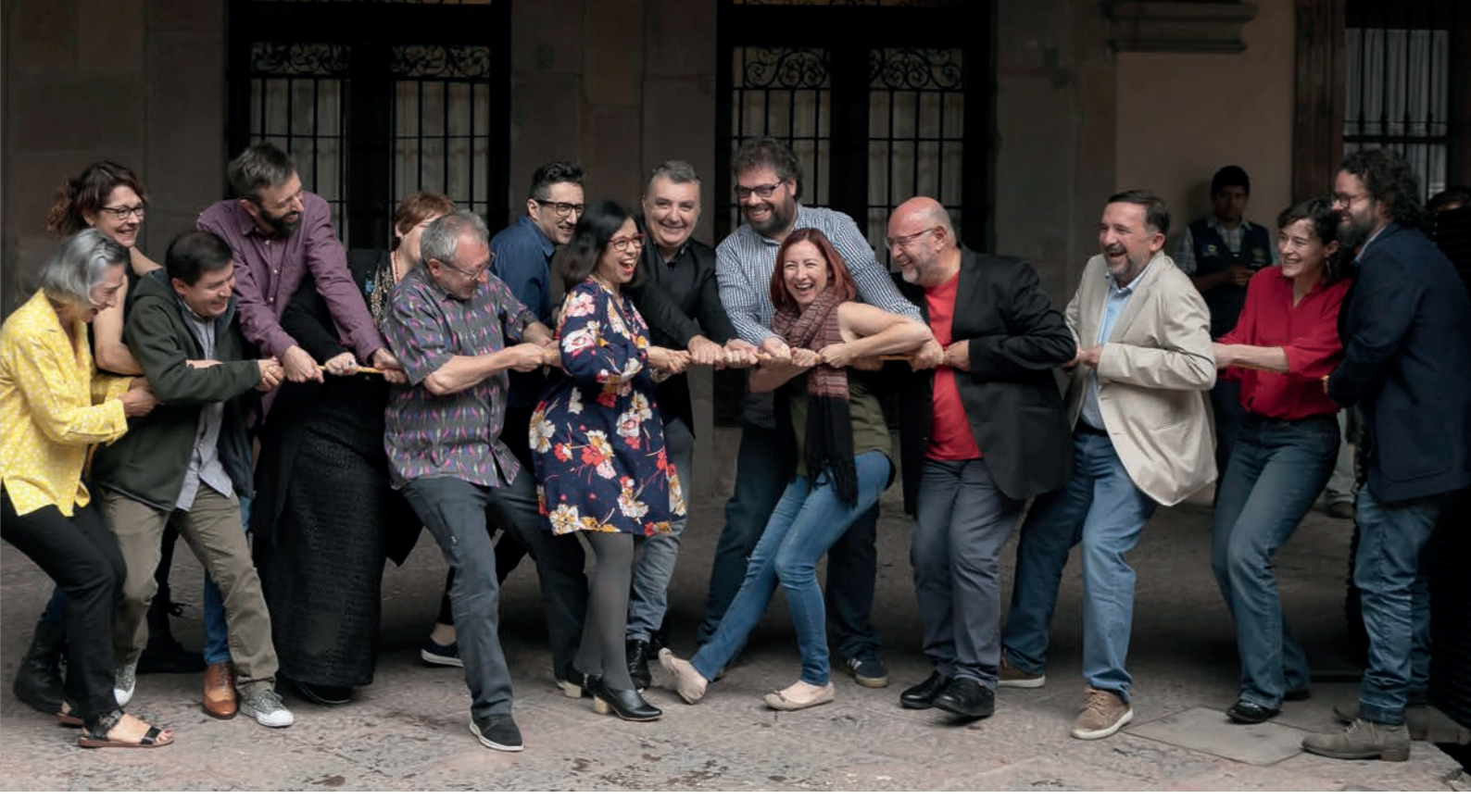
The team at Hay Festival Querétaro