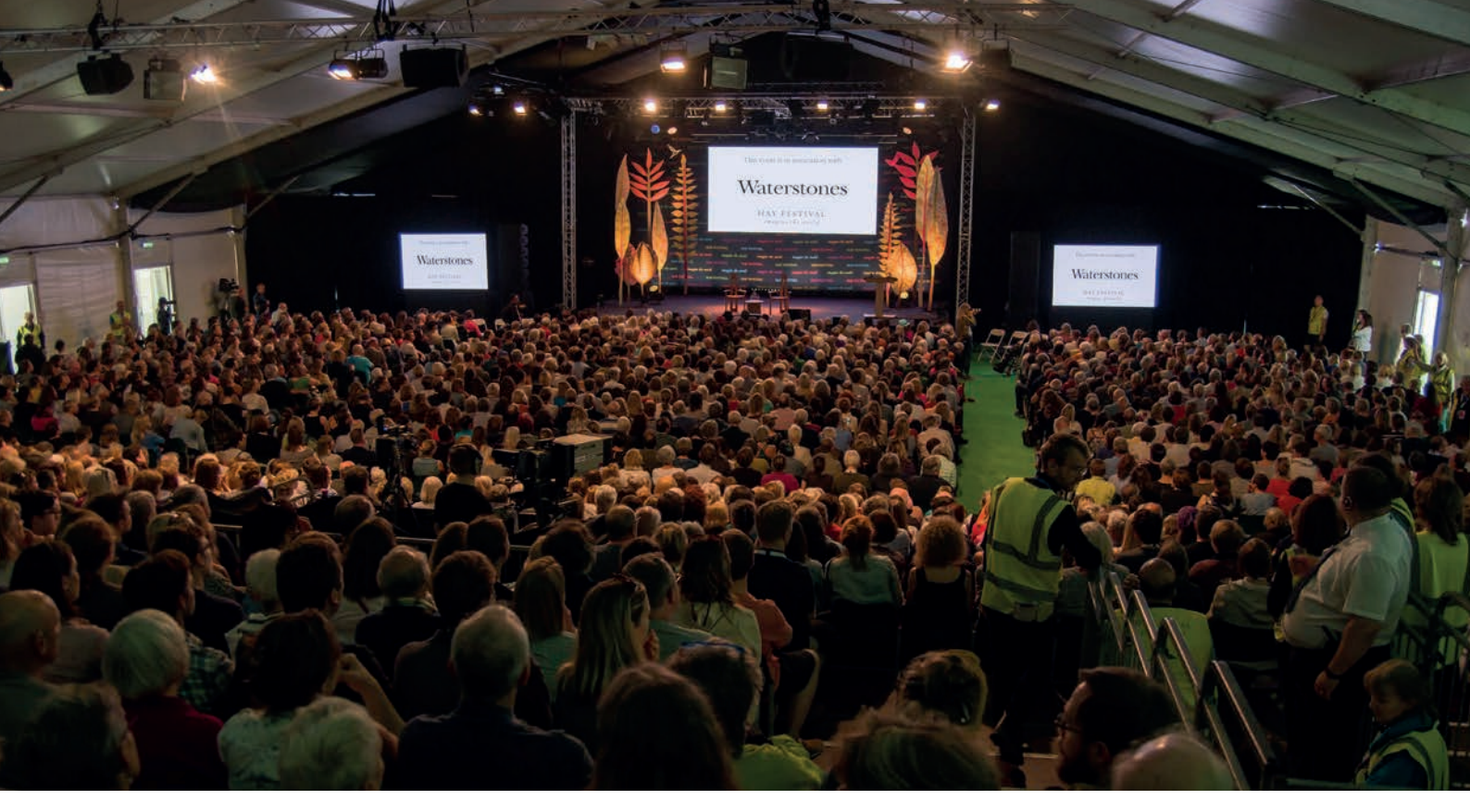
Hay Festival Wales audience