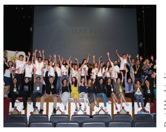
Volunteers at Querétaro 2016